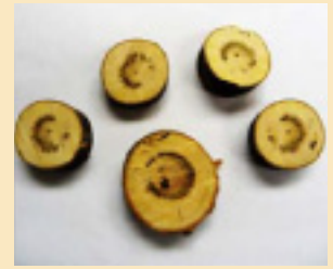
Verticillium on maple.