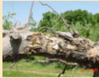
Canker (Black rot) – apple.