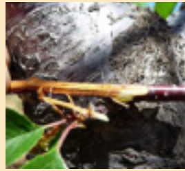
Bacterial canker on cherry.