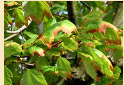
Figure 1: Early scorch symptoms on maple.

Leaf scorch is a physiological disorder that presents as discolored tissues on the margins and sometimes between the veins of tree and shrub leaves (Fig. 1). In severe cases the whole leaf turns brown, shrivels up and drops off. Leaf scorch is, in fact, a reaction to an unfavorable environment. Though there might be multiple reasons for this condition, scorch is most often a direct result of an inadequate water supply.