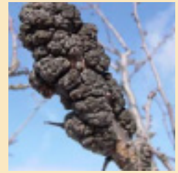
Black knot on plum.