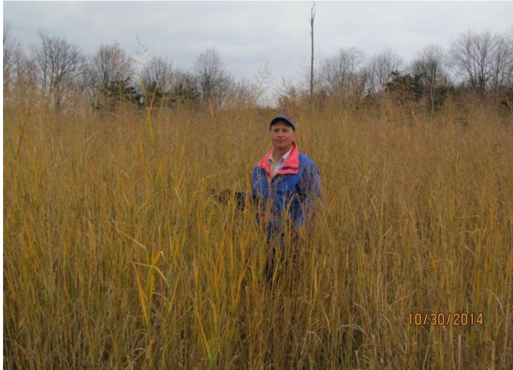
Figure 2. Kanlow switchgrass growth on a reclaimed surface mine at Alton, WV.

end of the third year (Fig. 2). Kanlow switchgrass almost doubled from 2011 to 2014 from 4.0 Mg ha -1 to 7.9 Mg ha -1 (Table 2). BoMaster increased from 2.7 Mg ha -1 to 7.3 Mg ha -1 (Table 2). Both varieties produced well over the 5.0 Mg ha -1 limit set to show economic viability for growth of switchgrass biofeedstocks on mined lands.