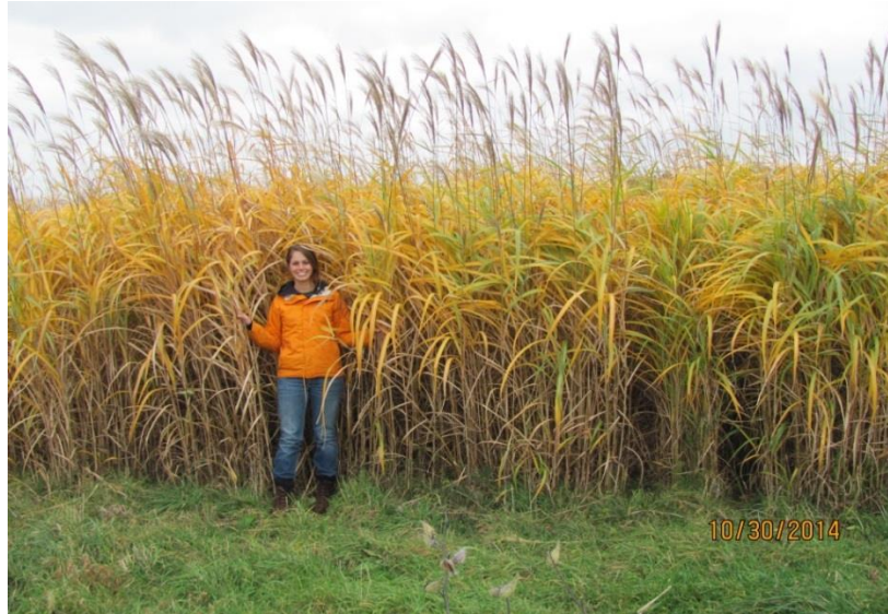
Figure 4. Private variety of Miscanthus grown on a reclaimed surface mine at Alton, WV.