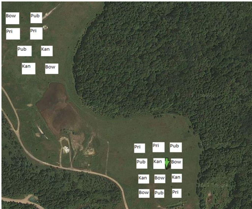
Figure 1. Alton site location of 0.4-ha plots of switchgrass (Kanlow and BoMaster) and Miscanthus (Public and Private).

Clipping of switchgrass and Miscanthus plots began in October of 2011, two years after establishment, and each year thereafter. Switchgrass was clipped by hand to a 10-cm cutting height in six randomly located 0.21-m 2 quadrats in each plot. Miscanthus was clipped at the same cutting height from a randomly-selected single plant in a 0.81-m 2 area (0.9 x 0.9 m area). All biomass was dried at 60°C for 48 hours to a constant weight and weighed to determine DM yield and converted to Mg ha -1 .