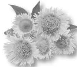
CHAMOMILE (Annual/Perennial) Varieties for Gardens: Common Chamomile; Roman