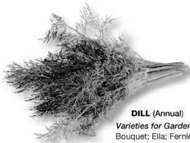
DILL (Annual) Varieties for Gardens: Bouquet; Ella; Fernleaf