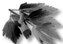
LOVAGE (Perennial) Varieties for Gardens: Lovage