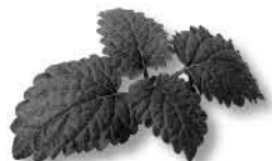
MINT (Perennial) Varieties for Gardens: Common Mint