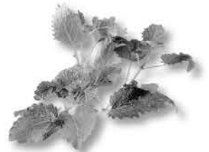
LEMON BALM (Perennial) Varieties for Gardens: Lemon Balm