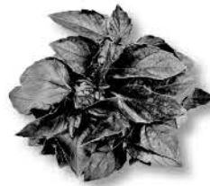
BASIL (Purple) (Annual) Varieties for Gardens: Dark Opal; Red Rubin; Purple Ruffles; Osmin