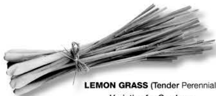
LEMON GRASS (Tender Perennial) Varieties for Gardens: East Indian