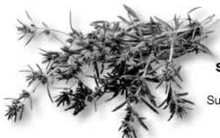
SAVORY (Annual/Perennial) Varieties for Gardens: Summer Savory; Winter Savory