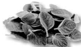
THYME (Perennial) Varieties for Gardens: German Winter; Lemon Thyme