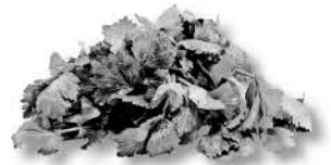
CELERY (Cutting) (Annual) Varieties for Gardens: Cutting Celery