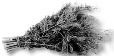
LEAF FENNEL (Tender Perennial) Varieties for Gardens: Bronze; Bronze and Green