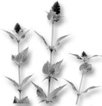
ANISE HYSSOP (Tender Perennial) Varieties for Gardens: Anise Hyssop