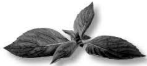
BASIL (Asian) (Annual) Varieties for Gardens: Sweet Thai; Cinnamon; Holy