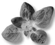
OREGANO (Perennial) Varieties for Gardens: Greek Oregano