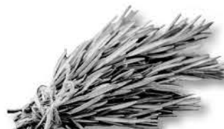
ROSEMARY (Tender Perennial) Varieties for Gardens: Rosemary