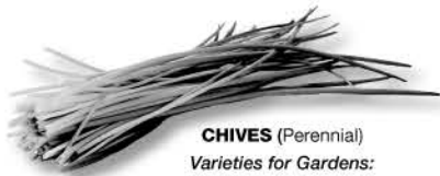
CHIVES (Perennial) Varieties for Gardens: Dolores; Purly; Staro