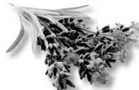
LAVENDER (Perennial) Varieties for Gardens: Elegance Purple