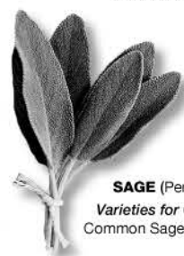
SAGE (Perennial) Varieties for Gardens: Common Sage; Pineapple