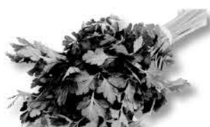
PARSLEY (Leaf) (Biennial) Varieties for Gardens: Giant of Italy; Titan