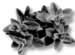
MARJORAM (Tender Perennial) Varieties for Gardens: Sweet Marjoram