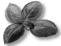
BASIL (Sweet) (Annual) Varieties for Gardens: Eleonora; Genovese; Genovese-compact; Aroma2; Emily