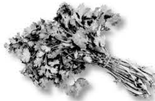
CILANTRO (Annual) Varieties for Gardens: Calypto; Santo