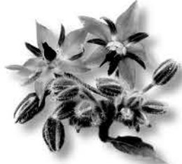
BORAGE (Annual) Varieties for Gardens: Borage