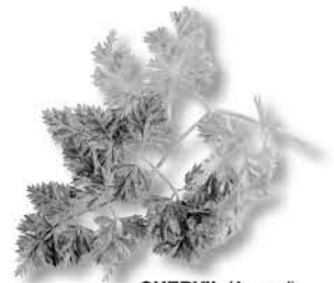
CHERVIL (Annual) Varieties for Gardens: Vertissimo